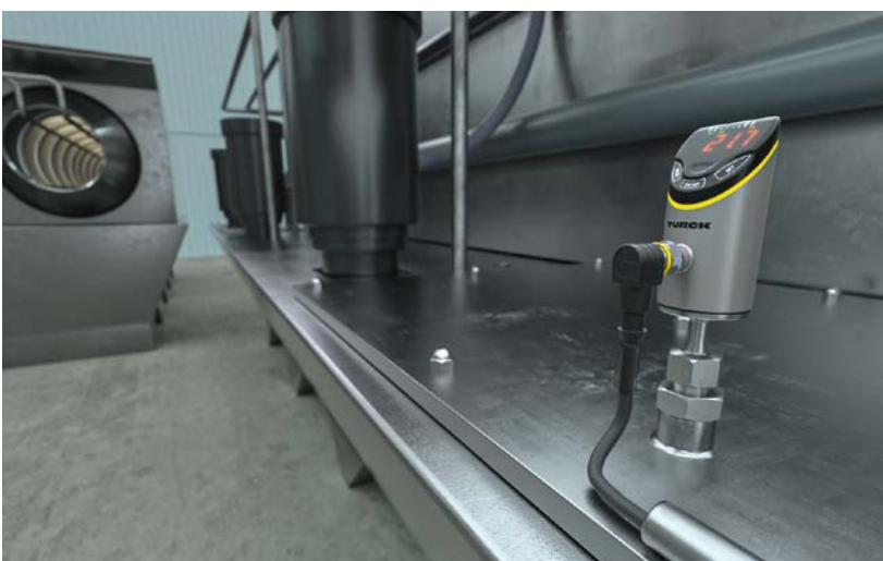
Temperature measurement on drum washers

In order to ensure the quality and efficacy of sealing processes, the sealant temperature must not drop below a defined value. The temperature sensors of the TS+ series enable users to implement their specific requirements precisely and maintain the desired quality without losing excess energy in the system. Besides saving energy resources, the achieved temperature control can considerably extend the service life of the dosing head, thanks to the reduced input of thermal energy.