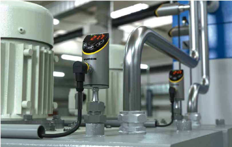
Temperature measurement on hydraulic power units

In addition to the actual process temperature, the temperature of the hydraulic oil is an important process variable on hydraulic power units. A hydraulic temperature of over 80 °C can often cause lasting damage to components and a considerable shortening of component service life. This often requires the implementation of additional maintenance measures with cost-intensive downtimes. The temperature sensors of the TS+ series support the user in the control of cooling circuits so that these efficiently support the overall application as required.