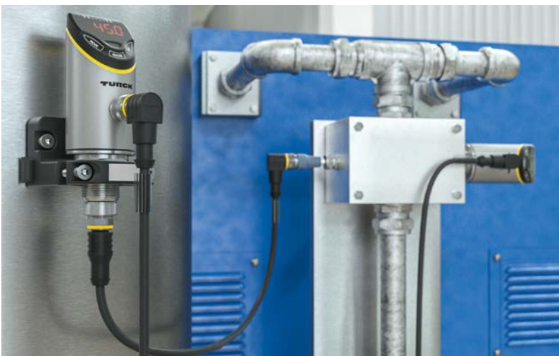
Temperature measurement on dosing heads

In addition to the actual process temperature, the temperature of the hydraulic oil is an important process variable on hydraulic power units. A hydraulic temperature of over 80 °C can often cause lasting damage to components and a considerable shortening of component service life. This often requires the implementation of additional maintenance measures with cost-intensive downtimes. The temperature sensors of the TS+ series support the user in the control of cooling circuits so that these efficiently support the overall application as required.